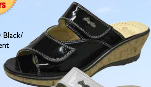
#30 Black/ Patent