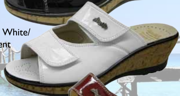
#21 White/ Patent