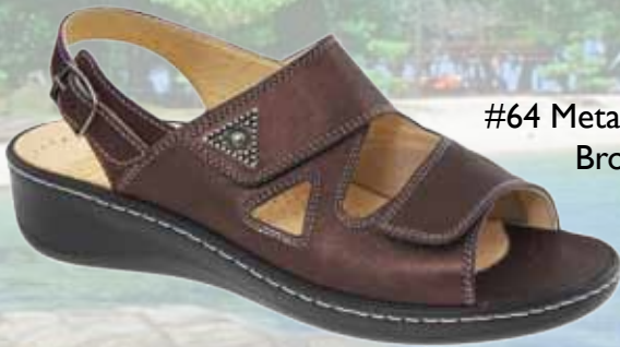
#64 Metallic/ Brown