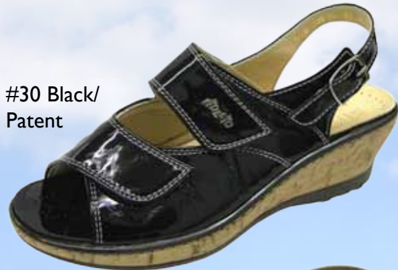
#30 Black/ Patent