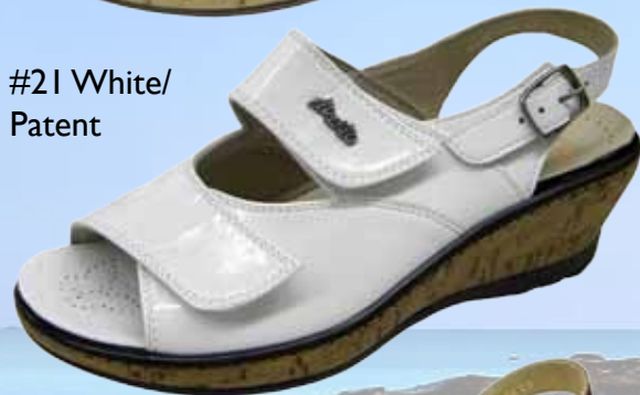
#21 White/ Patent