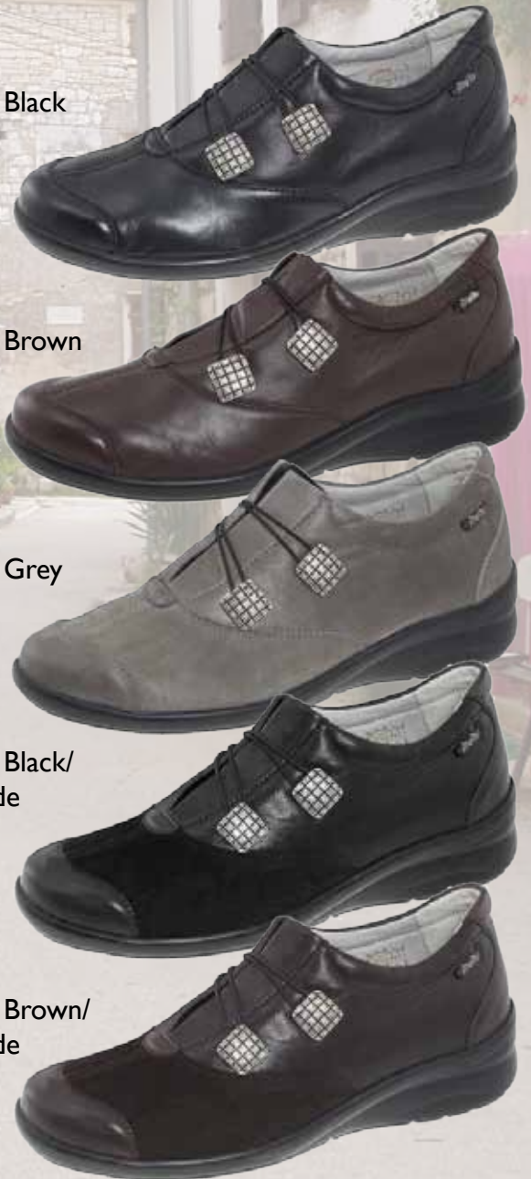
#44 Brown/ Suede