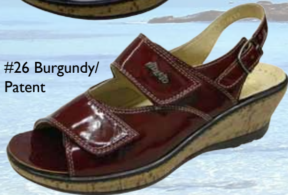
#26 Burgundy/ Patent