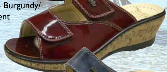
#26 Burgundy/ Patent