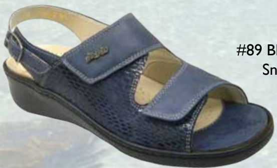
#89 Blue/ Snake