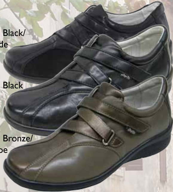
#08 Bronze/ Taupe