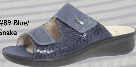
#89 Blue/ Snake

SEASONAL COLORS are available in all styles that have this seal next to them. Call your FIDELIO rep for availability.